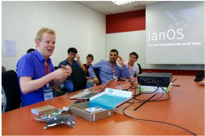
Workshop room: 30 pax