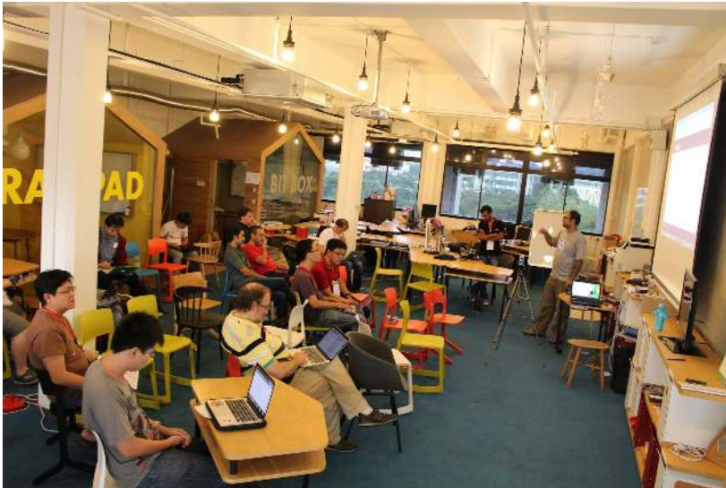
Seminar room: 60 pax