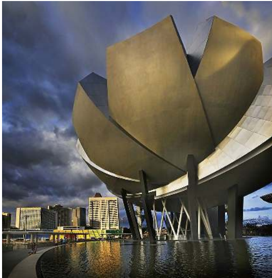
Art Science Museum