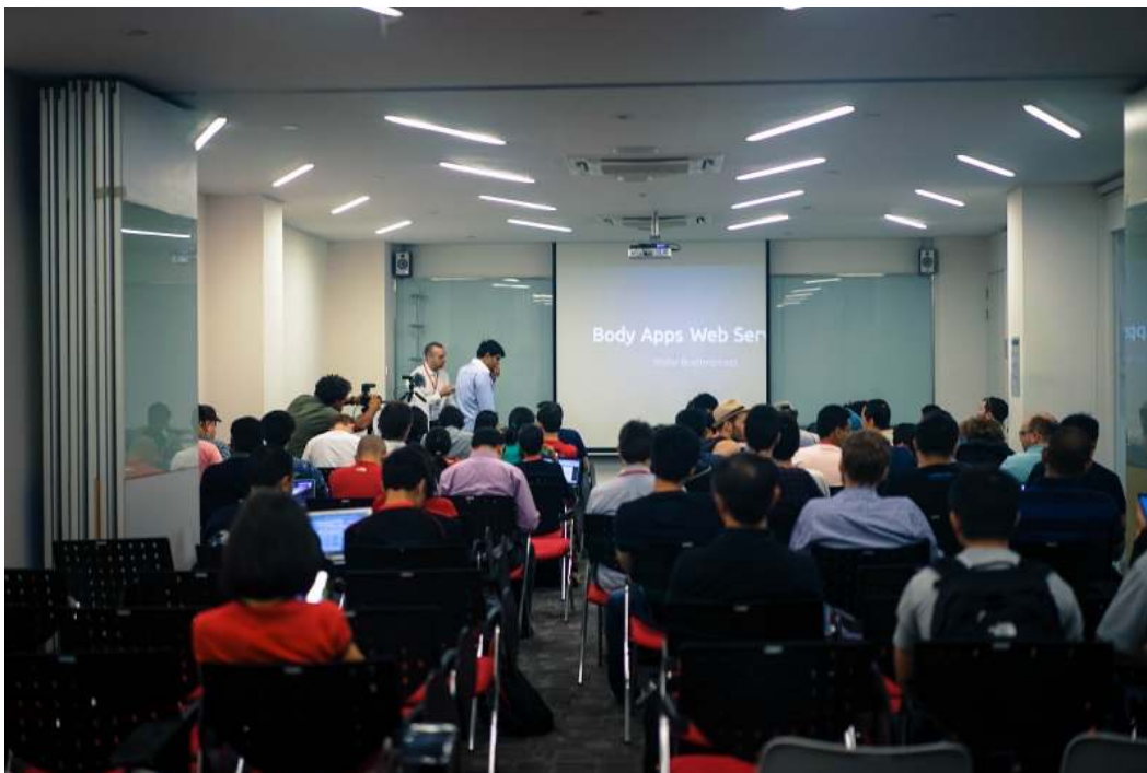
Seminar room: 80 - 100 pax