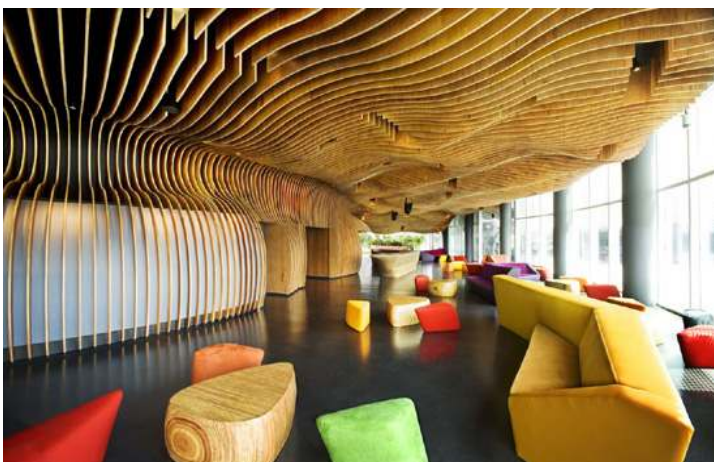
Genesis Lounge: 300 standing