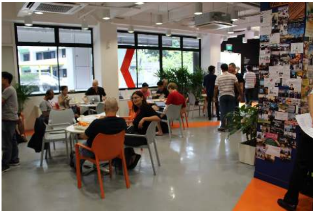
Open space for discussion