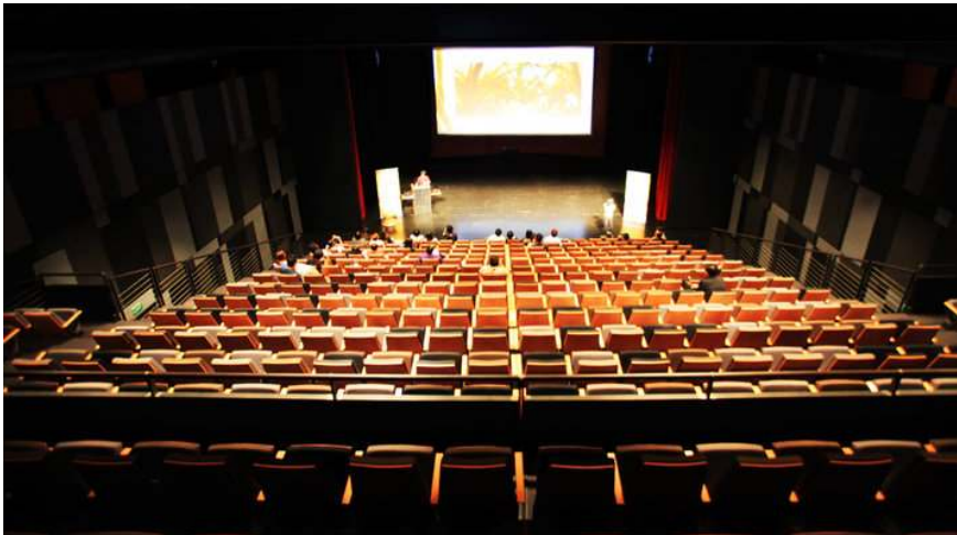
Genesis Theatre, Fusionopolis: 440 seats