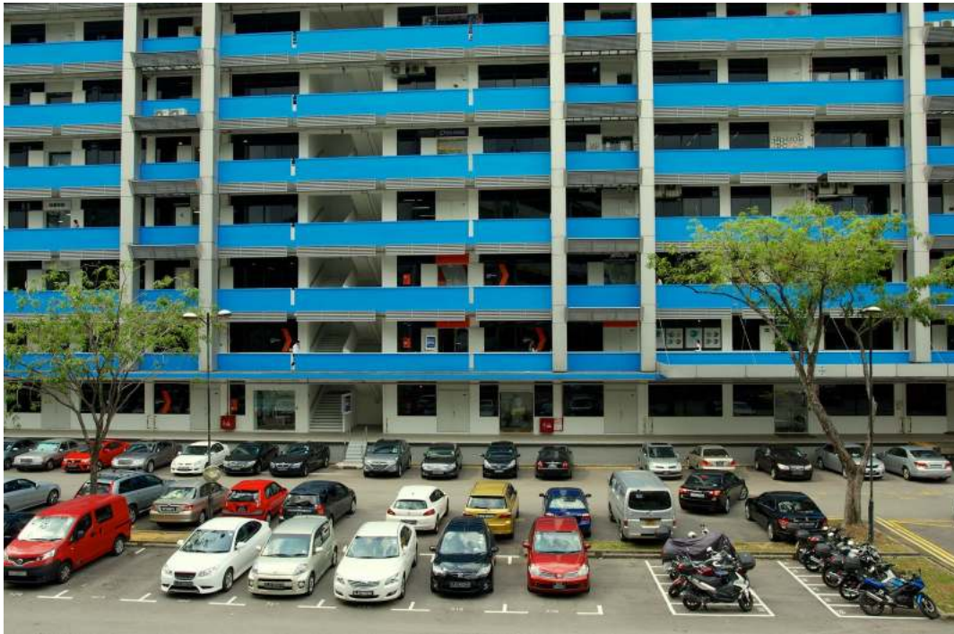
Seminar building Blk 71