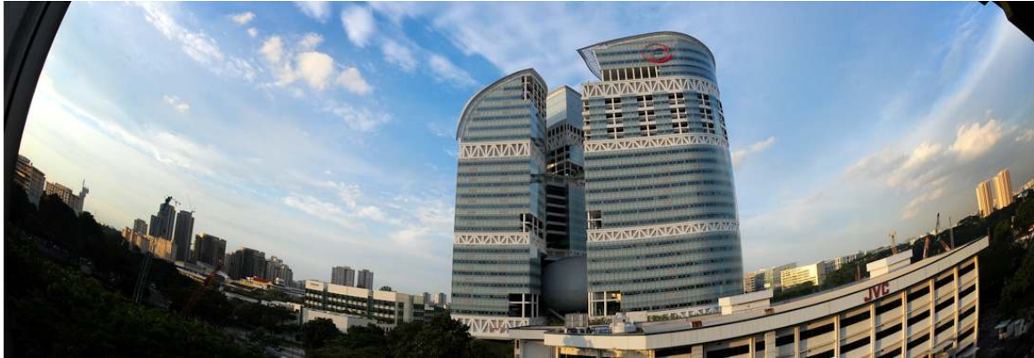
Main theatre building - Fusionopolis